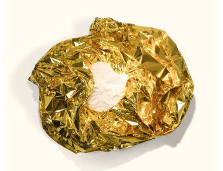
ANA VUJOVIĆ, Ctrl + Alt + Del (2) , 2020, emergency blanket, plaster, 70 x 56 x 27 cm

For their first exhibition in Paris, Hestia gallery wishes to exalt the quintessence of what they believe they share with their host: L'Atlas is a place where multiple geographies meet to present artistic disciplines and movements from around the world. The Western canon tends to define «world art» as a singular, homogeneous unit, while in reality a multitude of art worlds coexist. With this in mind, Hestia sheds light on practices from diverse regions with little exposure in Western institutions: Bosnia, Chile, Estonia, Greece, Serbia and Spain. The title Intimate/Outspoken further asserts the existence of the inner world of the artists presented and the need for their voices to be loud and carefully heard.